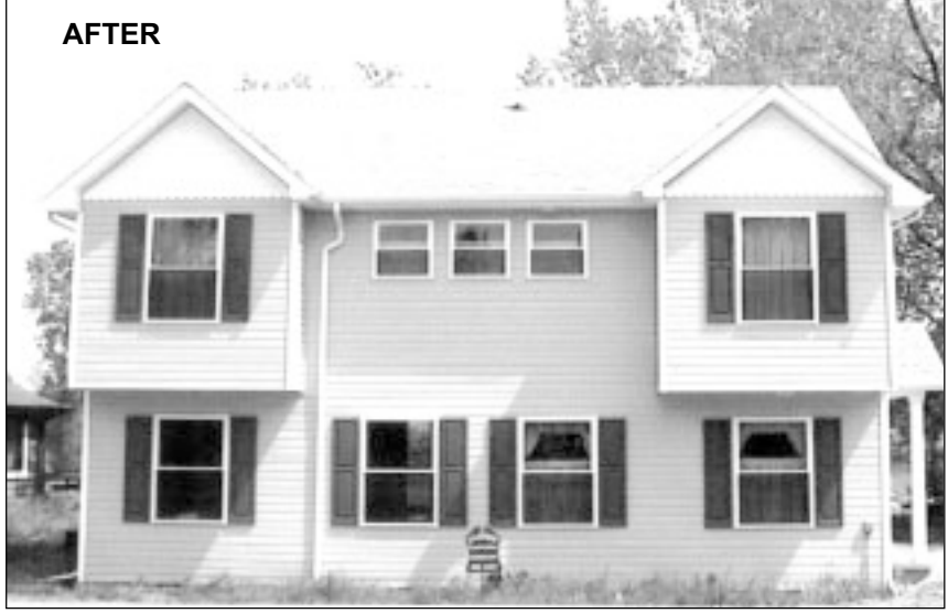
The homeowners more than doubled the size of their small cottage and enjoy a beautiful lake view from their new deck.

Once again, Mel and his production team live up to our motto, "WHAT YOUR MIND CAN CONCEIVE, OUR HANDS CAN CREATE". Great job guys!