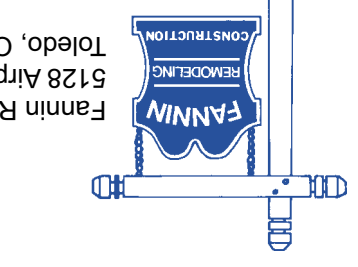
Fannin Remodeling Co. 5128 Airport Hwy. Toledo, OH 43615