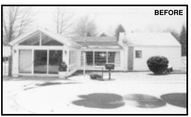
BEFORE: Exterior Flat Roof