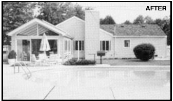
AFTER: New Roof System Offers Better Water Drainage and Updates Appearance Of The Home