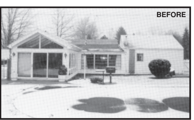
BEFORE: Exterior Flat Roof