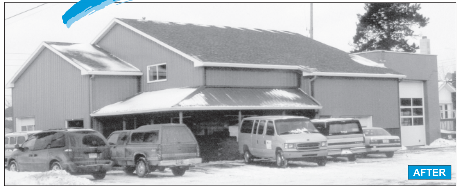
New Gable Roof With Dimentional Shingle

In November 2003, we raised the roof on Delker's Automotive. What a difference!